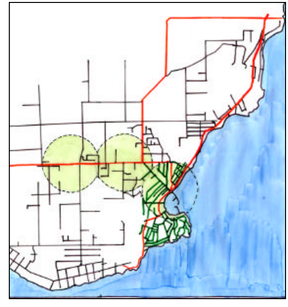
Arterials and street systems with 500m (5-minute walking distance) radius around major destinations.

Lower Gibsons density and connections facilitate walking; most residents feel they do not need cars as their needs are met, "Many Lower Gibsons residents don't even have cars as they find all they need in the shops here and perhaps can not afford a car," Village Store Operator. Therefore, it seems financial constraints also facilitate the reduction of car dependency and promotion of alternate modes of transportation.