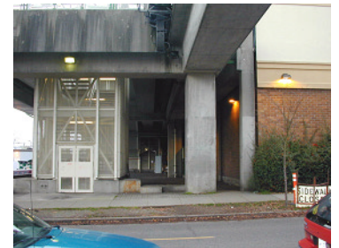
section of the Broadway Skytrain station located on East Broadway at Commercial drive