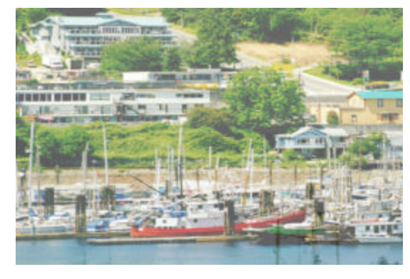
In Lower Gibsons, vision and reality are connected as Council supports a diverse working harbour with a variety of shops, services and maritime industry.